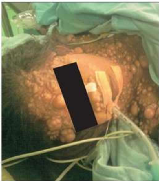
Fig. 4: Intubated patient