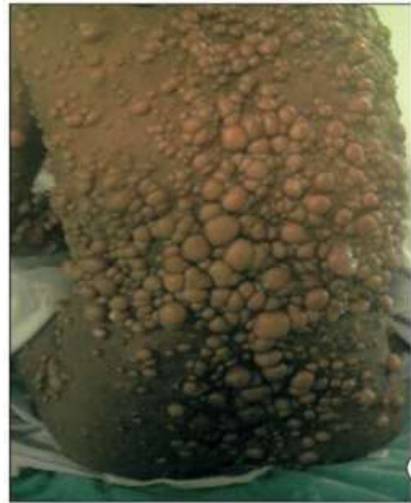
Fig. 1: Patient with multiple neuromas

Isoflurane, and inj Vecuronium. After the conclusion of surgery, the patient was reversed with Glycopyrrolate and neostigmine and awake extubation was done.